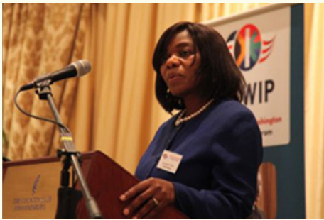
Keynote speaker, Advocate Thuli Madonsela, SA Public Protector

SAWIP's annual Leaders for Leadership Dinner again provided opportunities for our alumni to network with and learn from respected, established and influential leaders from across our social, political and economic landscape. These engagements also enabled a flow of ideas, perspectives and experiences across the generations.