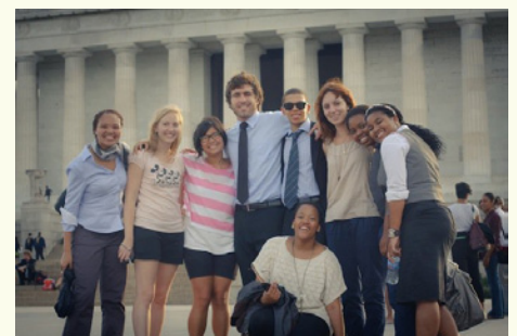
Posing in front of the Lincoln Memorial