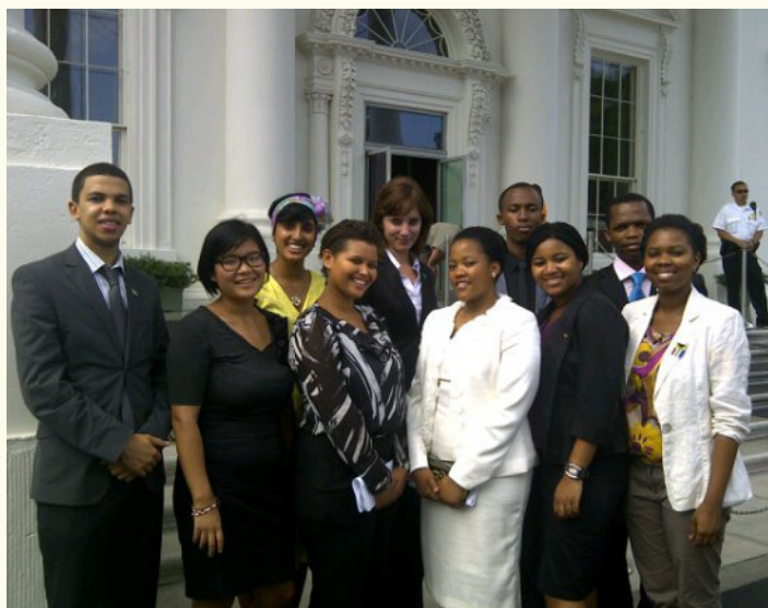
After a tour of the White House

SAWIP must seek out and engender synergistic relationships with corporate partners – such partnerships would also give Corporates recognition in terms of support for society and associated legislative requirements. Social Responsibility Managers should become “Friends of SAWIP” in order that together we can identify the opportunities for their organisations to support and invest in creating a new generation of leaders that can materially contribute to the nation’s socio economic development.