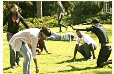
LeadYoung participants trying to make a square with a rope