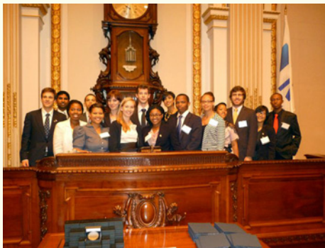
At the New York Stock Exchange

I accessed a current SA CSI publication. A review of its content revealed that the Corporates had key focus areas for their CSI Foundations supporting education, health care and hygiene, feeding, shelter, chronic illness, sport, arts, skills development, entrepreneurship, etc. but not once did I find reference to support for developing the next generation of leaders who will contribute to the ongoing transformation of society and nation building imperatives.