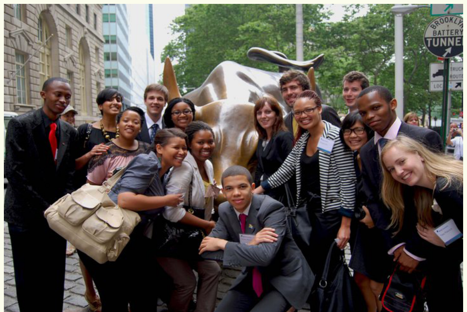
With the Wall Street Bull