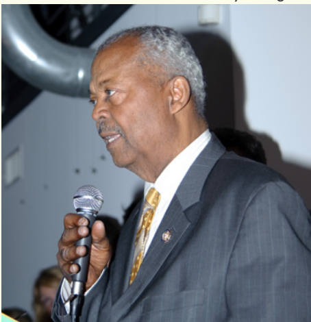
SAWIP Patron Congressman Donald Payne