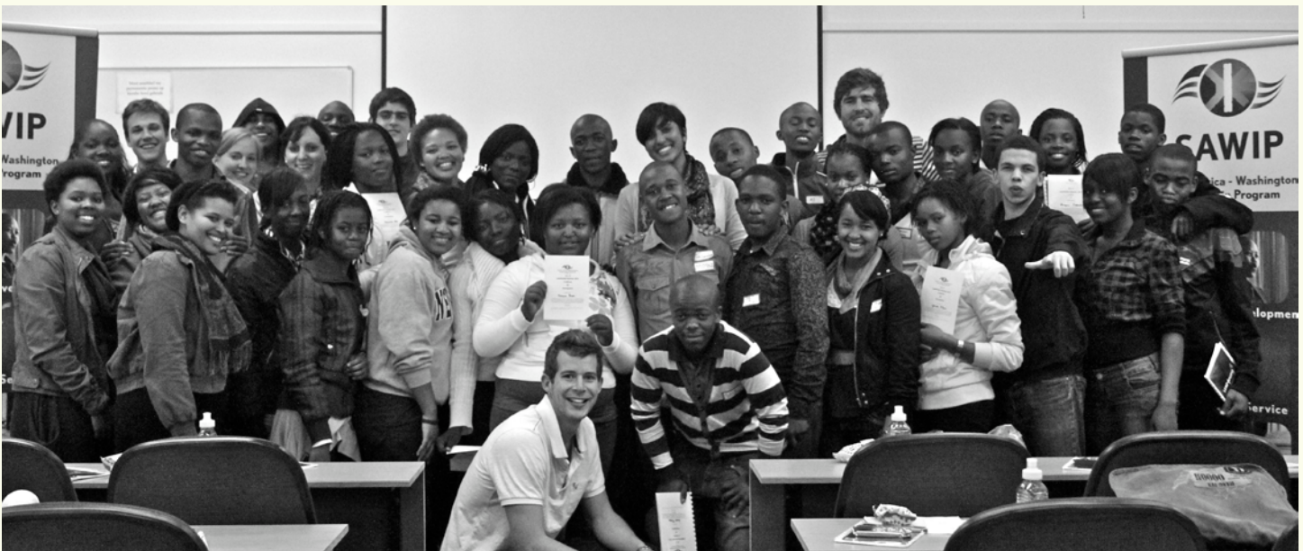
SAWIPers and LeadYoung participants