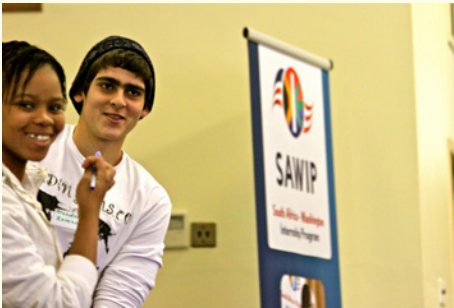
Enthusiastic LeadYoung participants

On the 18 th of September 2011, 24 teenagers left Stellenbosch on a high, eager to take back home what they had learnt from an exciting weekend with the SAWIP team. And we, as a SAWIP team, were on that same high. Despite all the difficulties we faced trying to organise the weekend, we came out knowing that it was all worth it.